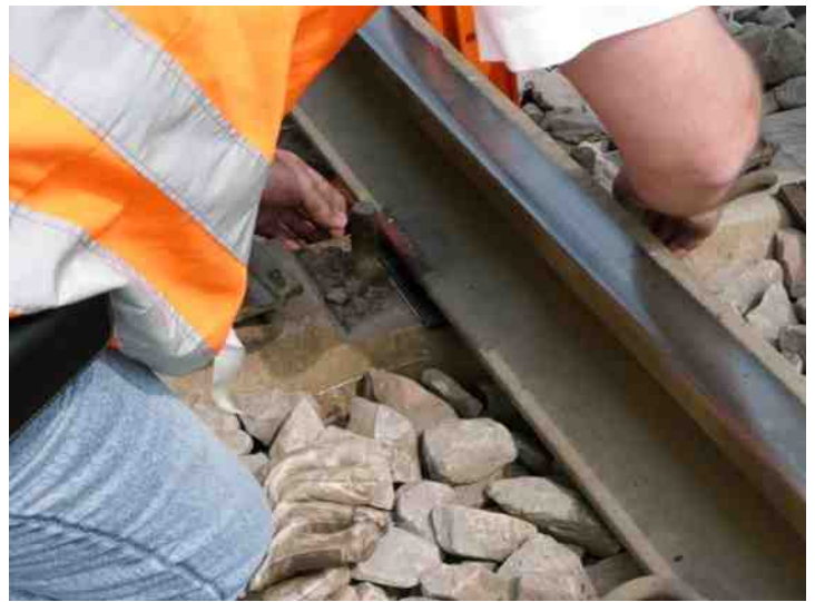
Easy and fast installation by changing the existing pads with the MONI Sensor.