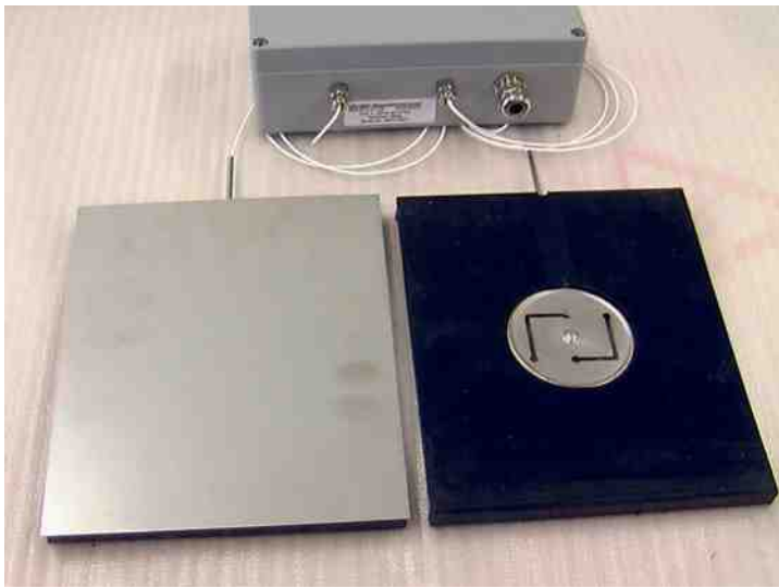
MONI sensors, two per sleeper, and their connector box, without cable protecting sleeves; right sensor without cover plate.